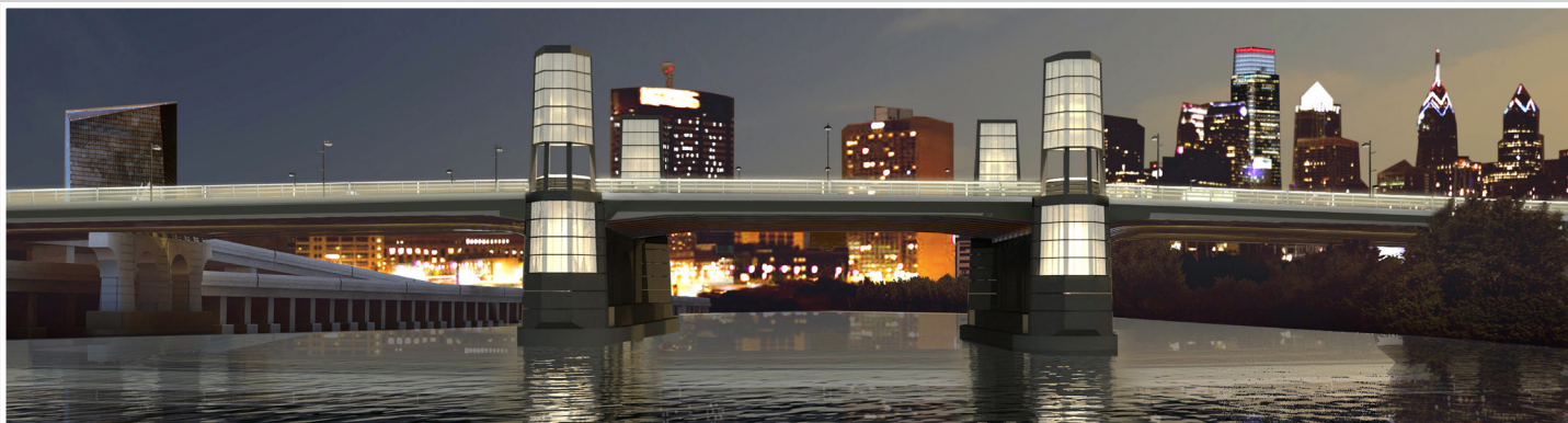
Rendering: Don Shepler