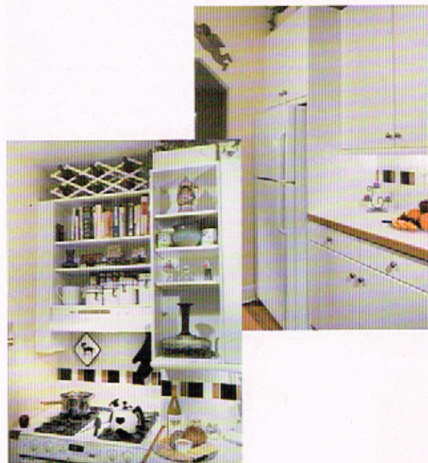
Lighting includes under-cabinet units as well as one central ceiling fixture. There's plenty of space for cookbooks and decorative pieces. The tile backsplash adds accents of color.