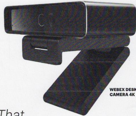
WEBEX DESK CAMERA 4K